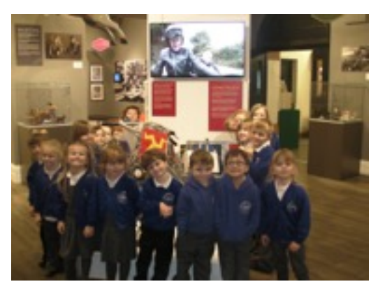
Class 1 Visit the House of Manannan's Toy Exhibition

In February Class 2 went on an evening trip to the Foxdale