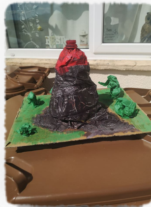
Last Day picnic, books ready to be collected, and an example of home learning.