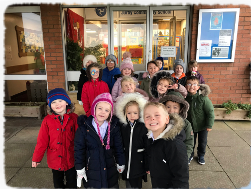
Class 1 about to go out on a trip. Post Lockdown fun and games in the sun.

All of these trips have been run at no cost to parents, with all of the costs being paid for by the Friends of Jurby School, which has amounted to well over a thousand pounds.