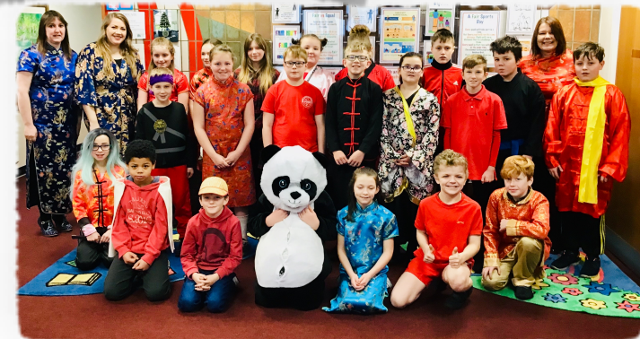
Class 3 all dressed up for Chinese New Year