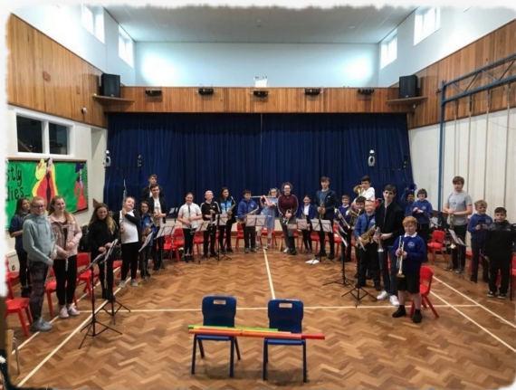
Whole school Music Day

Other musical events that we had planned for this year included Class 3 entering the Manx Folk Awards, and our pop up Choir singing. Sadly COVID put a halt to these activities.