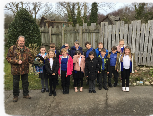
Class 2 with Plop the Owl and the Wildlife Park

During the course of the year Class 3 also celebrated Chinese New Year, with food of course, Class 1 was visited by a very naughty robot and Class 2 visited the Wild Life Park as part of their learning about animal habitats.