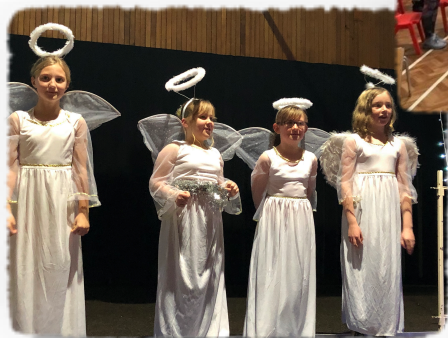
Angels visited us at Christmas